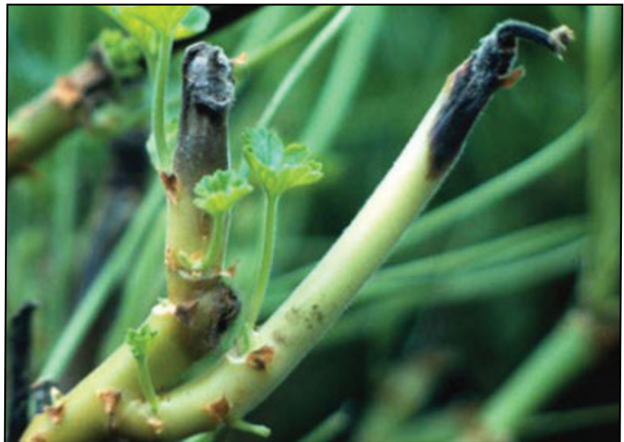
Figure 3. Characteristic necrosis caused by botrytis infection of cut or broken plant tissues.

Every grower knows the trade off between spacing plants out by the "text book recommendation," and the reality of profit generation. Growing pot to pot, or when growing plugs, or young cuttings, is fine...until the adjoining leaves start overlapping. It's not about light. It's about micro-climate! We all know if we wait too long, plants stretch when grown too close together.