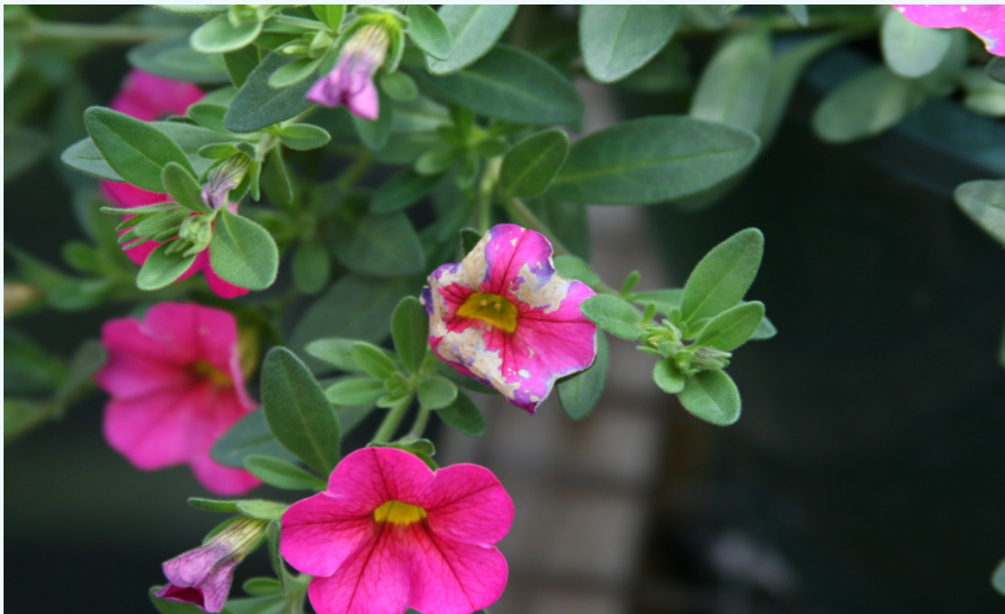
Petunia flower discoloration and petal necrosis caused by Botrytis . Those assigned to scouting need to be trained to look for more than just fuzzy grey mold.

The take home message is that pulse heating and venting a greenhouse will cost you far less than the cost of fungicides and lost profits from disease.