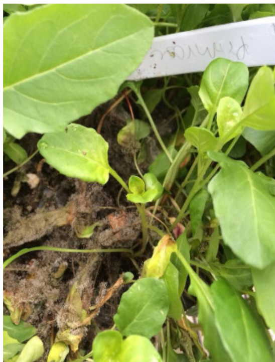
Figure 5. Young Oenothera speciosa seedlings affected by Botrytis due to crowding and poor air circulation within the plant canopy. HAF fan was on 24/7 nearby.

However, by that time you've already had a week or two of high humidity within those spaces between the leaves. The time to space plants out is critical to botrytis control. If you document crop losses and assign economic value, spacing them out properly a week earlier will likely save you money, not cost you. Schedule that labor!