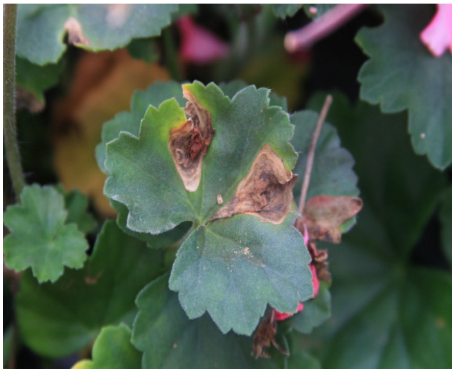
Figure 4. Classic infection of Geranium leaves, likely preceded by infection of senescing flower clusters or hanging basket debris nearby.