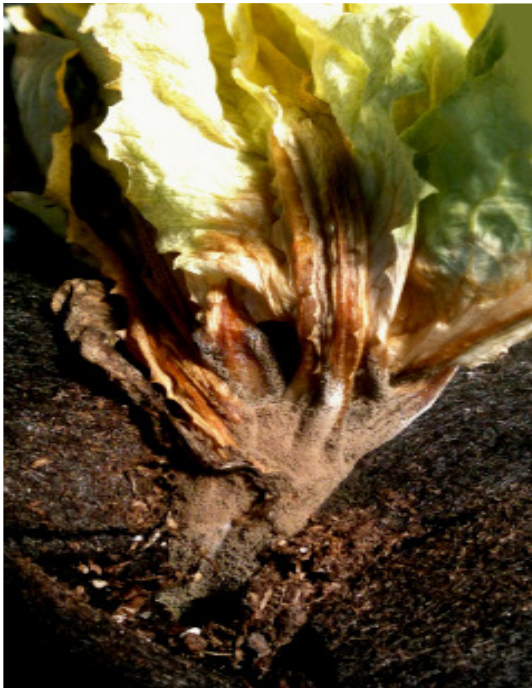
Figure 7. A significant infection of Botrytis on lettuce. The infection likely started at the mat/soil stem interface due to lack of air movement and high humidity.