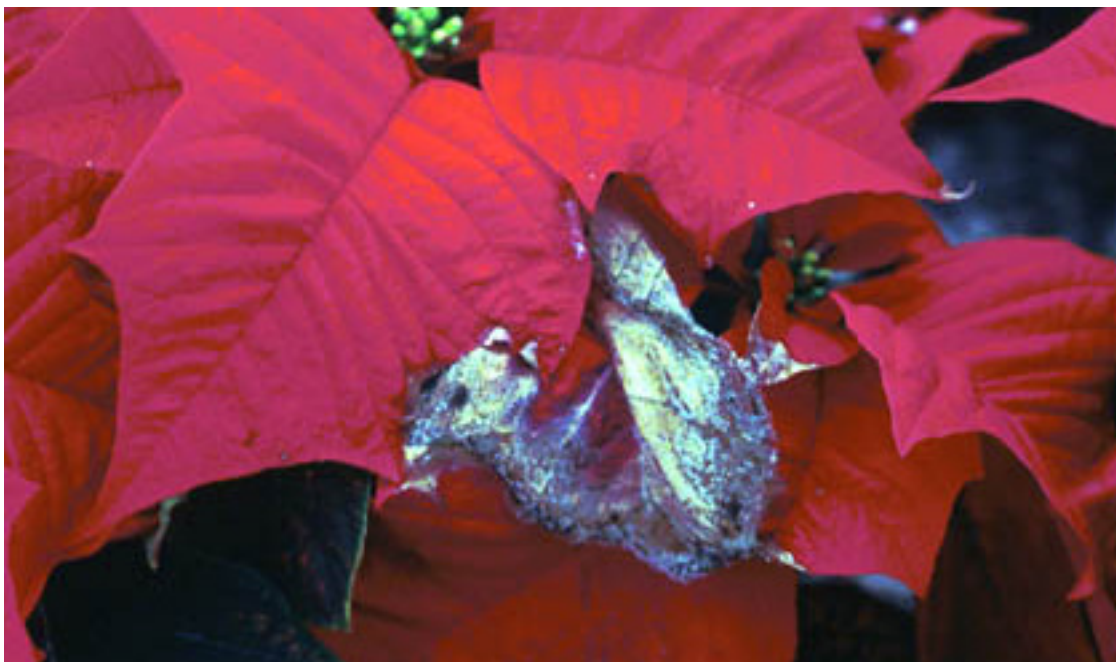
Figure 7. Botrytis infection on poinsettia. Rapidly shifting temperatures, cooler nights with rising relative humidity and the high density of the bract canopy can be a perfect combination for disease occurrence. HAF fans are essential, and a preventative program is recommended.

ity" is the ability of air to hold moisture at a certain temperature. The warmer the air, the more moisture it can hold, the less moisture settles on leaves, flowers etc. The cooler the air, the less humidity it can hold. Holding moisture is GOOD. Lowering air temperature without reducing humidity is a problem! When your moist greenhouse air cools, tiny droplets of condensation can form on the leaves. Condensation and micro-climate saturation of air pockets in cool, cloudy weather, in greenhouses without HAF