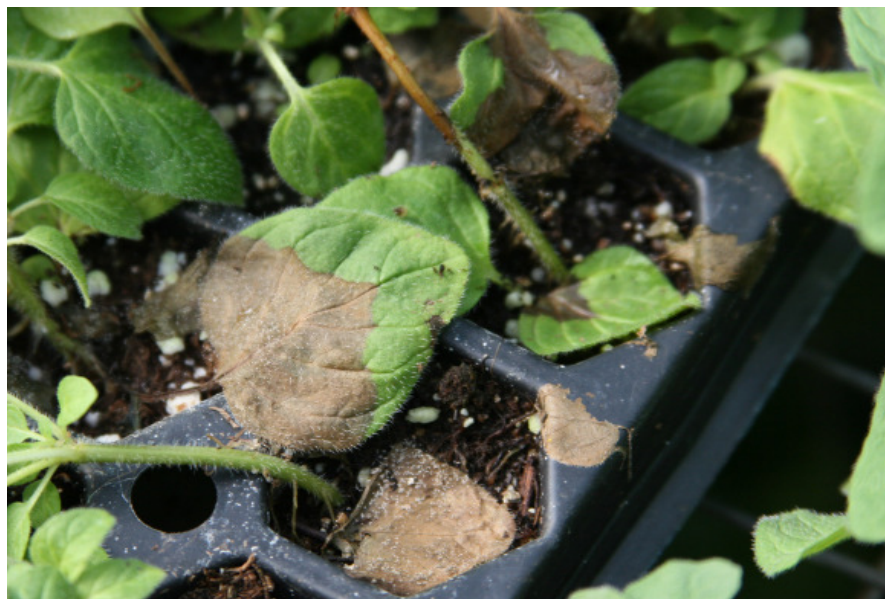
Figure 2. Botrytis infection of plug tray seedlings. This infection likely started with dead or dying leaves and spread quickly underneath the canopy.

and with those comes good, dry air circulation. Without fail, come mid-March, growers decide to save money and turn down, or turn off the heat. This is also about the time we see the resurgence of gulf moisture, and wild swings in temperature (The Spring "Swing" - See E-Gro Alert 3-15). Worst of all, the HAF fans are turned off at night to save money. This is also the time many crops such as Geranium start growing into each other. Reduced air movement in the seedling/young plant canopy, high humidity, wild swings in temperature equal a perfect environment for botrytis .