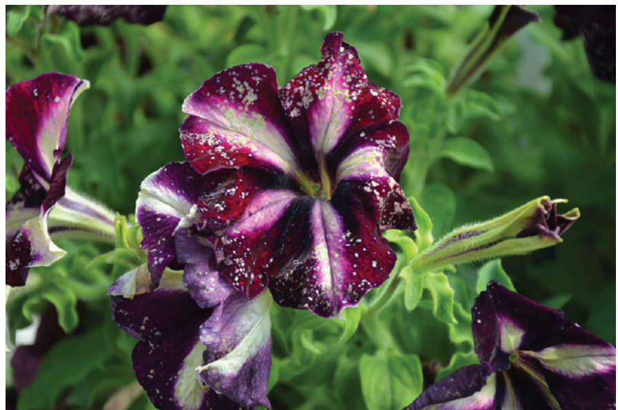
Figure 1. Classic petal spotting caused by Botrytis infection on a petunia hybrid. Soft, thin tissues such as flower petal tissue are particularly susceptible.