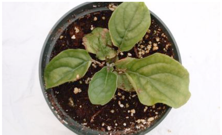
Figure 8. Slow growth and leaf discoloration occurs when plants are grown with ammonium-nitrogen and cool temperatures.