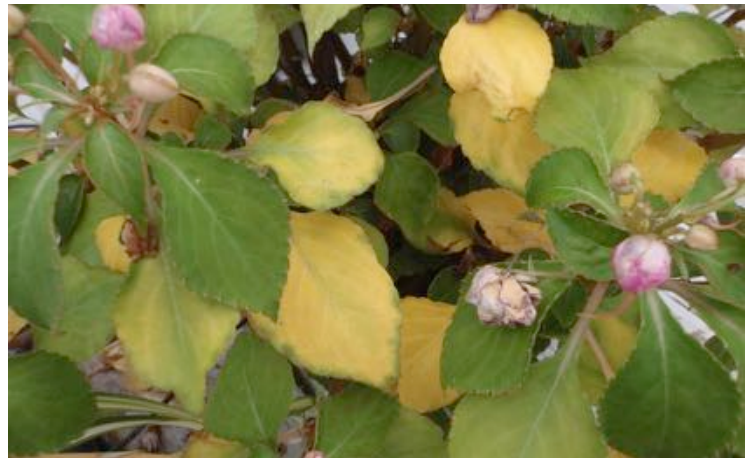
Figure 7. Lower leaf yellowing due to insufficient nitrogen being supplied to impatiens.