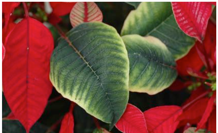
Figure 20. Poinsettias have a high demand for molybdenum and can develop deficiencies.