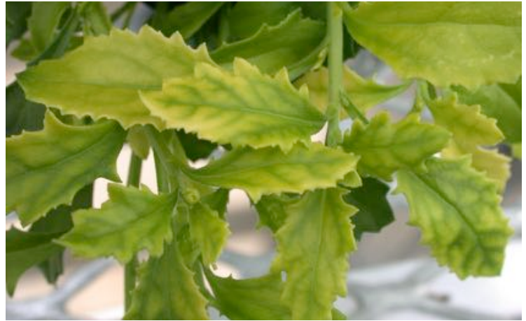
Figure 6. Excessive levels of phosphorus can hinder the uptake of iron in scaevola.

Being able to diagnose nutrient disorders requires knowledge of the factors that can lead to a disorder, as outlined above, and the common visual symptomology that occurs with each element. Due to mobility of elements in the plant, the use of