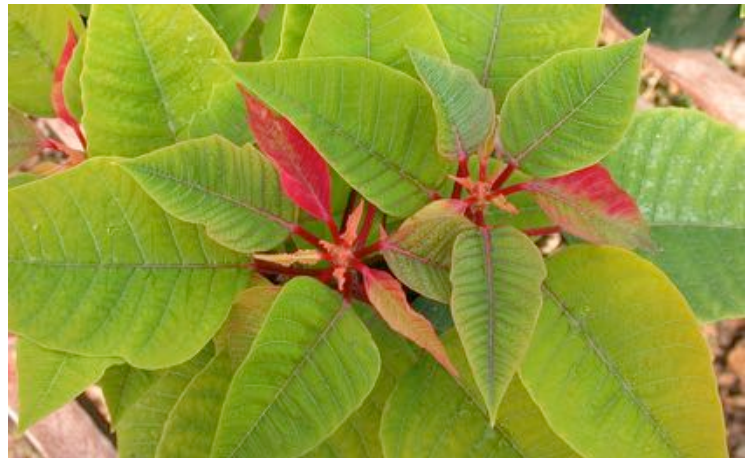
Figure 13. Sulfur deficiencies are not common. The use of Cal-Mag fertilizers which do not include sulfur can result in deficiencies if supplemental S is not supplied.