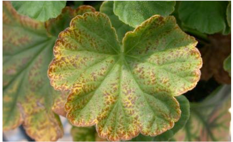
Figure 15. Lower leaf bronzing occurs on geraniums when the substrate pH is too low.

Plants such as marigolds develop bronzing on recently fully expanded leaves. The bronzing consists of numerous pinpoint spots that start yellowing and quickly turn bronze. Affected leaves become necrotic. On other crops, the older leaves develop numerous pinpoint necrotic spots across the blade (Fig. 15). The entire leaf may die as the spots enlarge. This disorder mainly commonly occurs on African marigolds ( Tagetes erecta ) and seed geraniums ( Pelargonium × hortorum ).