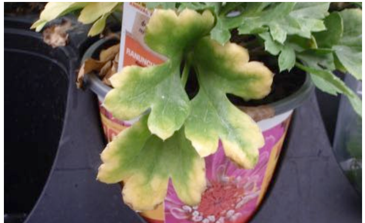
Figure 10. Ranunculus plants exhibiting lower leaf chlorotic margins due to low potassium levels.