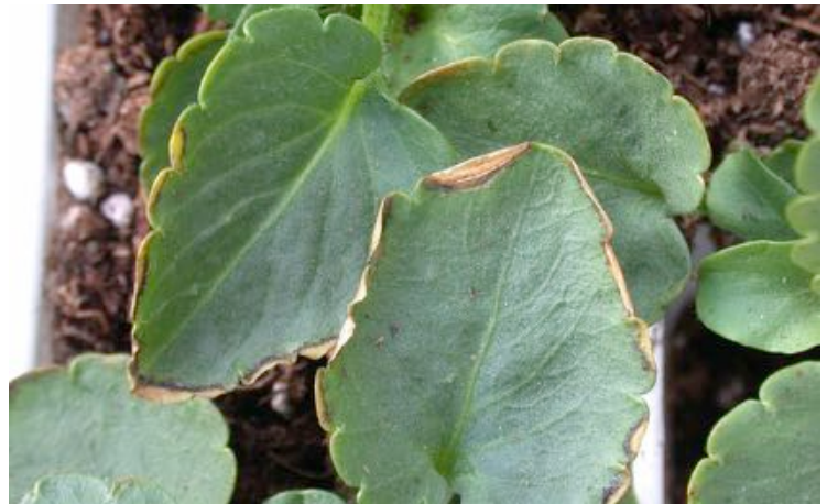
Figure 19. Overdose applications of boron on pansies resulted in leaf necrosis.