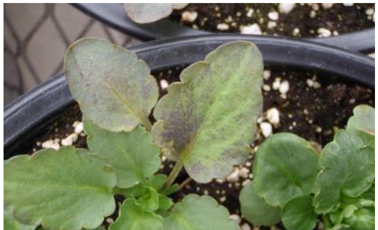
Figure 17. Lower leaf purplish-black spotting on pansy due to a low substrate pH.