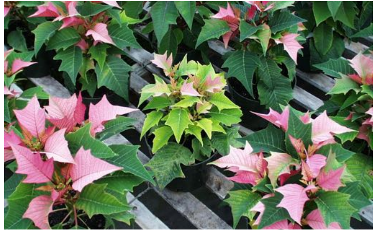
Figure 3. Discolored roots indicate a root disease problem and can hinder the uptake of nutrients by the plant.

Diseases such as Pythium , Phytophthora , and Rhizoctonia impair the root system resulting in inducing nutrient deficiencies. The most common element deficiency that occurs is Fe (interveinal chlorosis on the upper leaves). Phosphorus (lower leaf purpling) is also common. Plant growth is also commonly stunted with disease pressure. As with most biotic disorders, the pattern of problematic plants most likely is scattered across the bench. Inspect the root system if disease problems are suspected, specifically looking for white healthy roots versus discolored, brown roots affected by a disease (Fig. 3).