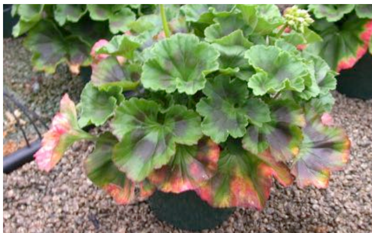
Figure 2. Low substrate temperatures can slow uptake of phosphorus and result in the development of an overall reddish-purple leaf coloration of the lower leaves.

Growing and substrate temperatures can also play a major role in the induction of nutrient deficiencies. One classic example is how low temperatures (less than 55F [13C]) results in a phosphorus deficiency in tomato, pansies (Fig. 2) and geraniums. Uptake of Fe is also hindered and can result in the appearance of interveinal chlorosis on the upper leaves. The lower temperatures result in a slower movement and a slower rate of uptake by the plants.