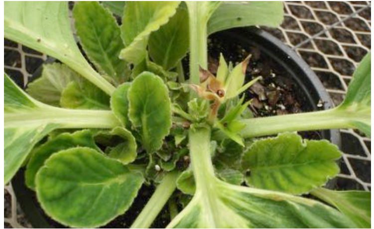
Figure 18. Growing conditions limited the uptake of boron by this gloxinia plant resulting in loss of the growing tip, flower bud, and the development of axillary shoots.

The margins of leaves in the middle canopy become chlorotic, presenting a silhouette appearance and then quickly become necrotic (Fig. 20). Symptoms spread up and down the plant. These leaves may also become misshapen, resembling a half-moon pattern with some crinkling; the necrotic leaf margins also may curl upward and inward.