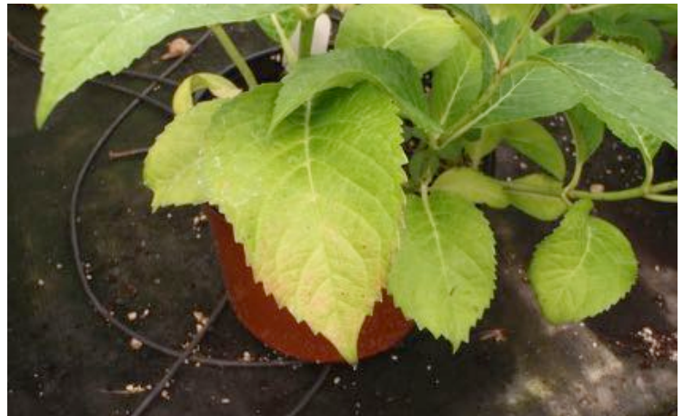
Figure 4. Insufficient nutrient levels will hinder plant growth and lead to the development of leaf symptomology. Lower leaf yellowing is occurring because of a nitrogen deficiency.

Soluble salts are the total dissolved salts in the substrate at any given time and can easily be measured by an EC meter. When the EC is too low, it can result in multiple deficiency symptoms. Lower leaf yellowing due to insufficient nitrogen levels is the most common problem observed (Fig. 4). EC levels below 0.75 mS/cm (PourThru extraction), 0.50 mS/cm (SME extraction), or 0.20 mS/cm (1:2 extraction) are threshold values to use when diagnosing low EC problems.