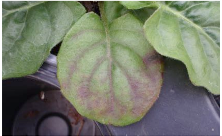
Figure 9. Purple discoloration on the lower leaves of gerbera due to inadequate phosphorus.

Phosphorus is mobile in the plant; therefore, deficiency symptoms are expressed in the oldest leaves. Leaves become darker green and often turn purple, which extends into the stem (Fig. 9). Because of low phosphorus solubility in soil, environmental conditions that may stunt roots, such as cold soil, exacerbate phosphorus deficiency.