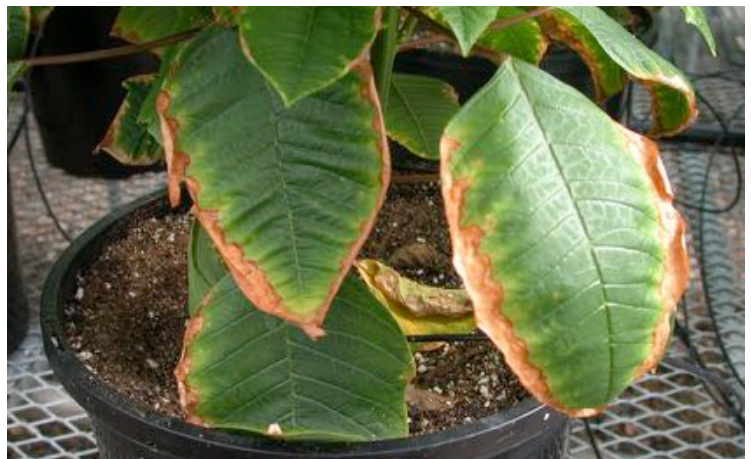
Figure 5. Excessively high levels of fertilizer can lead to lower leaf burn.

Excess substrate EC levels can result in stunted plant growth and elevated (luxurious) uptake by plants. Toxic levels of nutrients will result in marginal leaf necrosis of the lower leaves (Fig. 5). Elevated EC levels occur when the fertilizer concentration supplied to plants is in excess of the plant's needs. Root diseases also limit nutrient uptake and can result in the accumulation of elevated levels in the substrate. EC levels above 4.6 mS/cm (PourThru extraction), 3.5 mS/cm (SME extraction), or 1.26 mS/cm (1:2 extraction) are broad threshold values to use when diagnosing excessive EC problems.