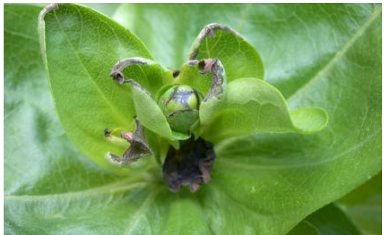
Figure 11. Tip burn and distorted leaves occur if calcium uptake is limited during periods of rapid growth, as what occurs during the summer with zinnias.