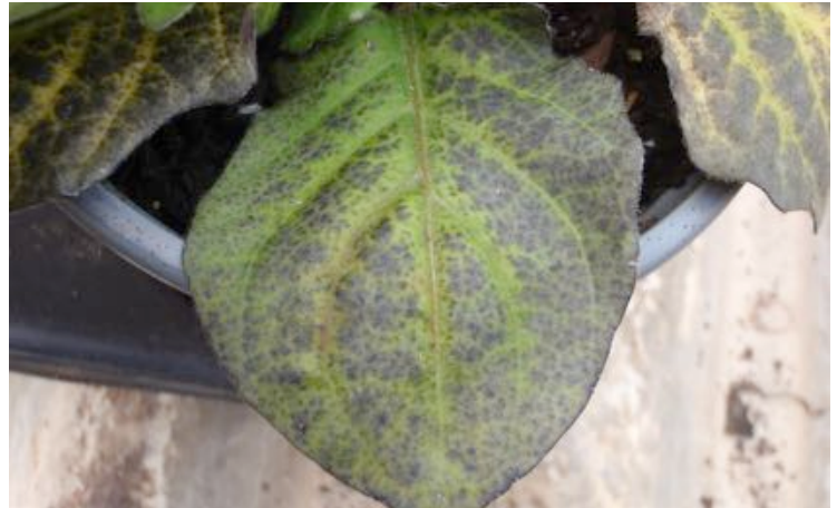
Figure 16. Lower leaf purplish-black spotting on gerbera due to a low substrate pH.

Young leaves are moderately to severely stunted and internodes are short, giving the stem a rosette appearance. These leaves are also chlorotic in varying patterns but tend toward interveinal chlorosis. As the deficiency progresses, necrosis develops.