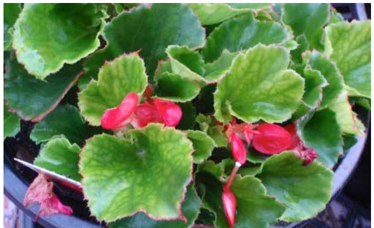
Figure 14. Wax begonias exhibiting iron deficiency symptomology.