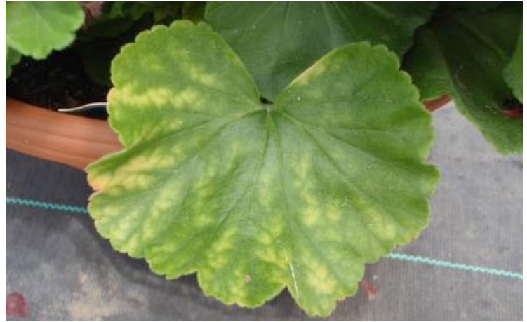
Figure 12. Lower leaf interveinal chlorosis occurs with geraniums provided extra calcium to avoid low substrate pH issues.

Foliage over the entire plant becomes uniformly chlorotic (Fig. 13). The symptoms may tend to be more pronounced toward the top of the plant. While symptoms on the individual leaf look like those of nitrogen deficiency, sulfur deficiency can be distinguished from nitrogen deficiency because nitrogen deficiency begins in the lowest leaves.