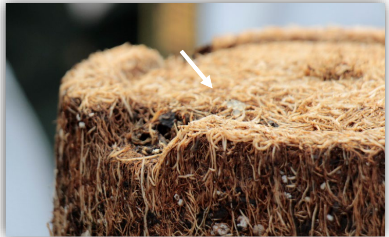
Image 3. A small mass of slug eggs are adhered to the roots of an overwintering container shrub. The clear eggs can easily be overlooked.

The radula is a slug's rasping tongue-like body part that is covered with tiny teeth. The radula scrapes plant tissue leaving small, irregular holes throughout the foliage (Image 4). Many times, slug damage is mistaken for caterpillar activity.