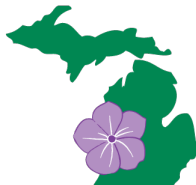
Michigan Floriculture Growers Council