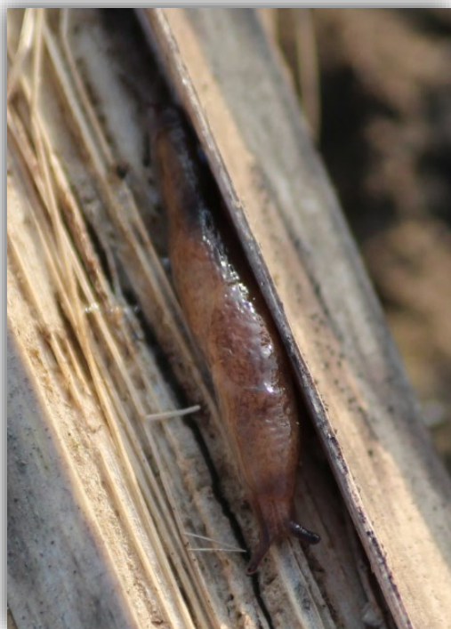
Image 1 (left). Numerous slug species can persist in greenhouses and garden centers. Slugs overwinter and hide in soil, plant debris, or leaf litter where it is cool and moist.

P.L. LIGHT SYSTEMS THE LIGHTING KNOWLEDGE COMPANY