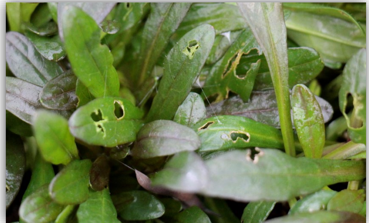
Image 4. Slug damage as visible on Ajuga 'Chocolate Chip' foliage can be mistaken for caterpillar damage. Caterpillars will generally leave fecal deposits around feeding sites while slugs do not.