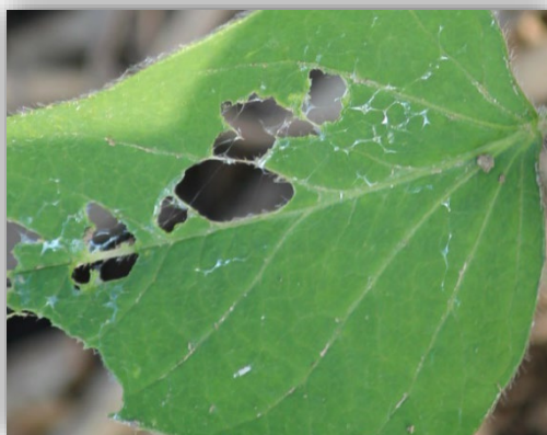
Image 2. The shiny silver trail on this leaf is a telltale sign of slug activity.