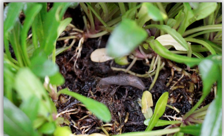
Image 5. A peek into the canopy of a recently watered container of Ajuga 'Chocolate Chip' reveals the presence of a Marsh slug ( Deroceras leae ).