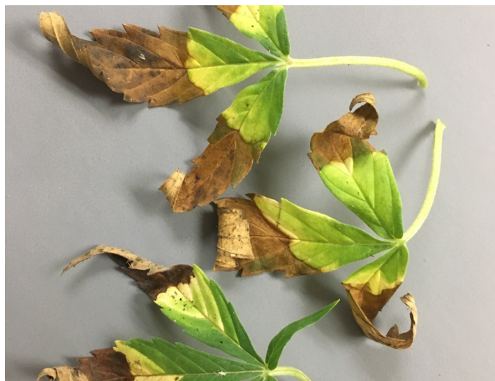
Industrial hemp is host to some important insect and disease problems. These symptoms are typical of 'hopperburn' from potato leafhopper infestation.

specialize in these groups. I have great appreciation for these professionals who play a critical role in our defense against damaging pests. Sometimes the need for an accurate identification has led us to entomologists outside the US, who I have found invariably glad to share their time and expertise.