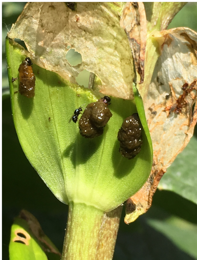
This small wasp ( Tetrastichus sertifer ) is parasitizing a lily leaf beetle larva. Some entomologists assess and introduce new biocontrols to help manage invasive species.

Educational outreach is the third leg of the program. Formal and informal presentations, field visits; email; in-person, phone and on-line (Zoom, e.g.) meetings; articles; newsletters; and websites are ways information is shared with growers, gardeners, civic groups, other entomologists, agriculture departments, etc.. Communication goes both ways of course; ideas for projects or solutions often come directly from producers and we learn from others just how effective or practical our recommendations really have been, or about solutions they may have discovered. Our organization maintains an advisory board of growers, landscape professionals, and home gardening representatives who provide input on changes to our programs or areas to address. We also continually engage with elected officials to keep them informed about our activities and responses to local issues, while helping them and their constituents better understand and appreciate agriculture.