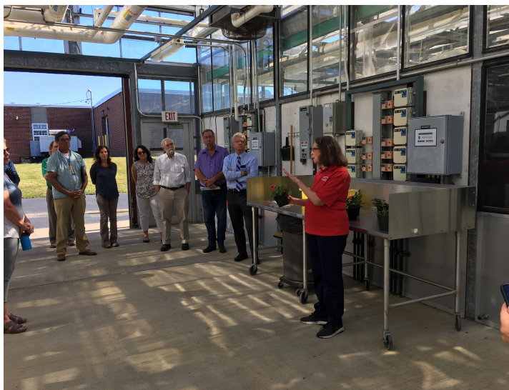
Elected officials and civic leaders are important supporters of agriculture and can make more informed decisions when included in education and outreach efforts.