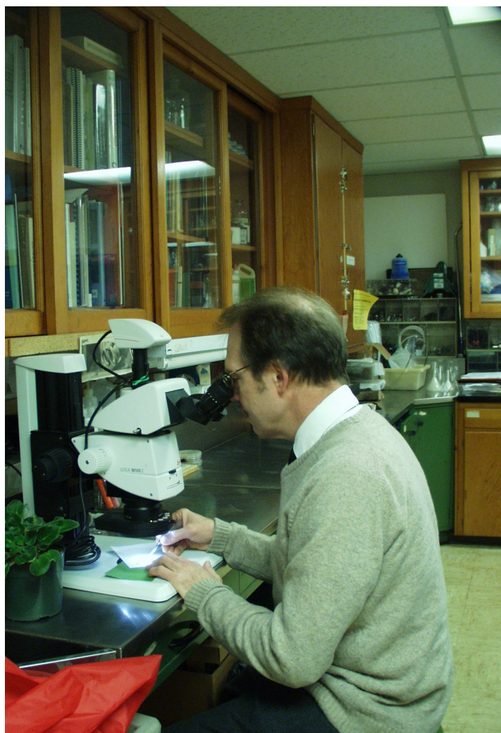
Examining insect samples in the diagnostic lab. Some growers have purchased inexpensive stereoscopes for checking their own samples or assessing biological control shipments.