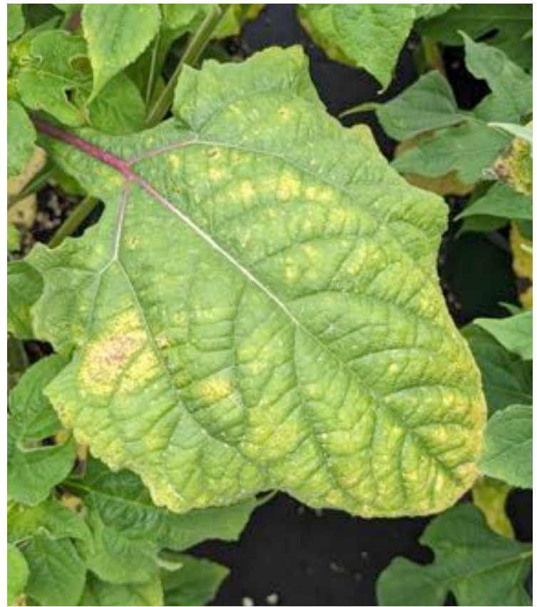
Figure 2. Initial symptoms of interveinal chlorosis on the lower foliage due to insufficient potassium (K).

Leaf Tissue Test Results. The results from the leaf tissue analysis tests changed the initial diagnosis (all value interpretations are based on averages for floriculture species because no species-specific recommendations exist for Mexican sunflowers). While low N (2.44%), satisfactory P (0.20%), and satisfactory S (0.26%) concentrations were in the leaves, Mg was excessive (1.65%) and so was Ca (6.42%). In addition, K was considered deficient (1.06%) and Fe excessive at 1280 ppm. Mn (167 ppm), Zn (70.6 ppm), and Cu (7.59 ppm), were considered satisfactory and B was considered elevated at 63.3 ppm.