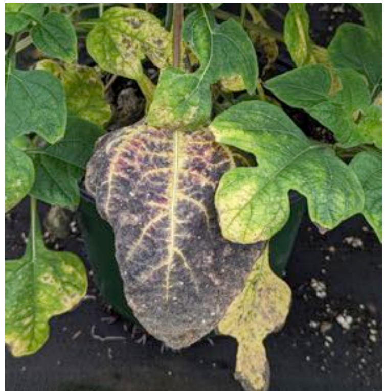
Figure 3. Lower leaf purplish-black coloration on Mexican sunflowers. On other species, low magnesium (Mg) can result in similar symptoms, but here potassium (K) was deficient and iron (Fe) was excessive in the leaf tissue.