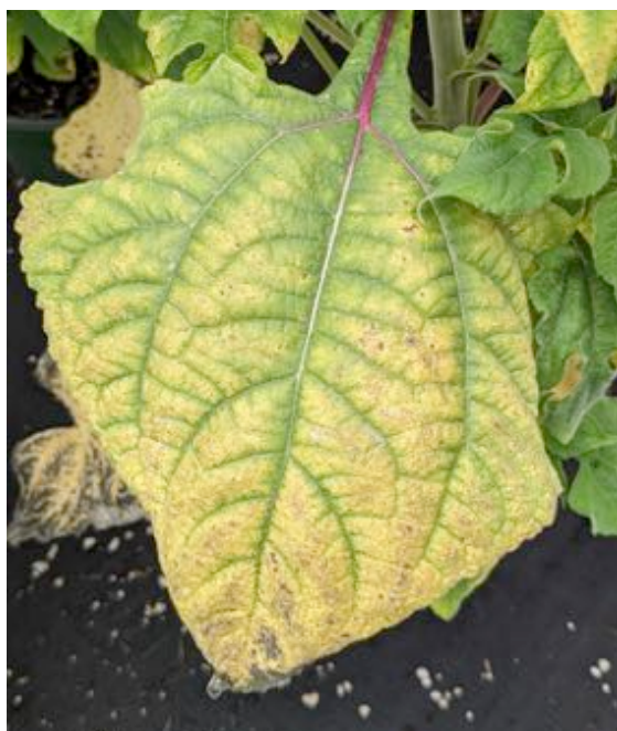
Figure 1. Intermediate symptoms of interveinal chlorosis on the lower foliage. Normally this is associated with low magnesium (Mg) concentrations, but in this case, potassium (K) was the limited element.

Mexican sunflower or red sunflower ( Tithonia rotundifolia ) is a tall growing background plant that attracts bees, butterflies, and birds. During a grower visit, we were asked to look at a set of plants to help diagnose a case of lower leaf interveinal chlorosis (Figs. 1 & 2) and purplish-black coloration (Figs. 3 & 4). The symptomatic plants were the remainders from a landscape order that the grower fulfilled. As a result, they were mature, in bloom, and fertilization was sporadic.