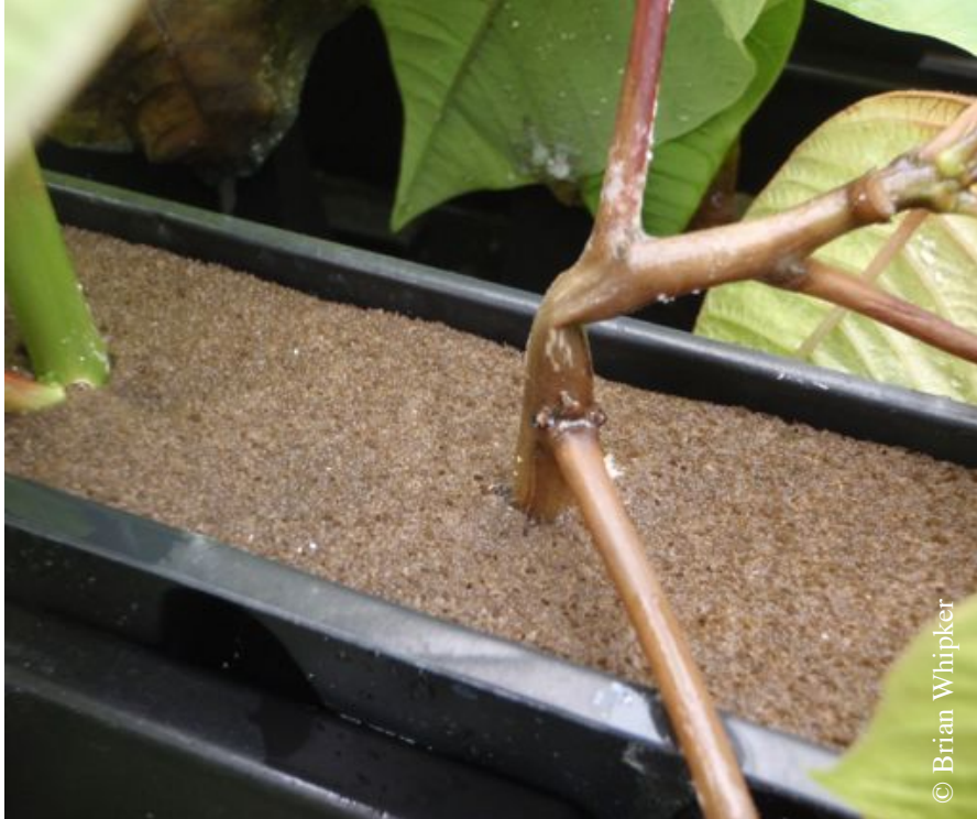
Figure 2. Collapsing stem associated with Bacterial Soft Rot. Check the cutting for a fishy smell to help confirm bacterial soft rot.