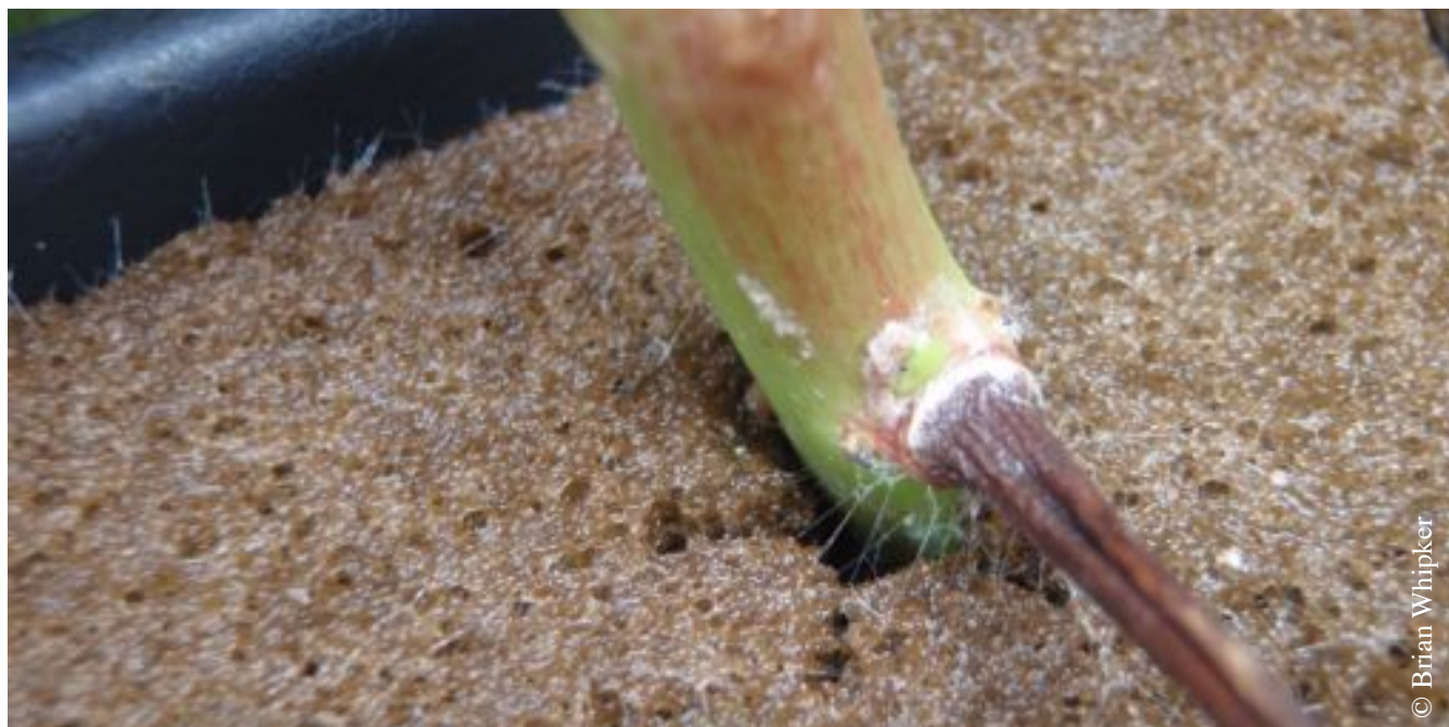
Figure 5. Close up of fungal strands (mycelium) which help to identify Rhizoctonia. Note at the back, left portion of the photo where mycelium can be seen growing on the root cube and attaching to the black plastic.