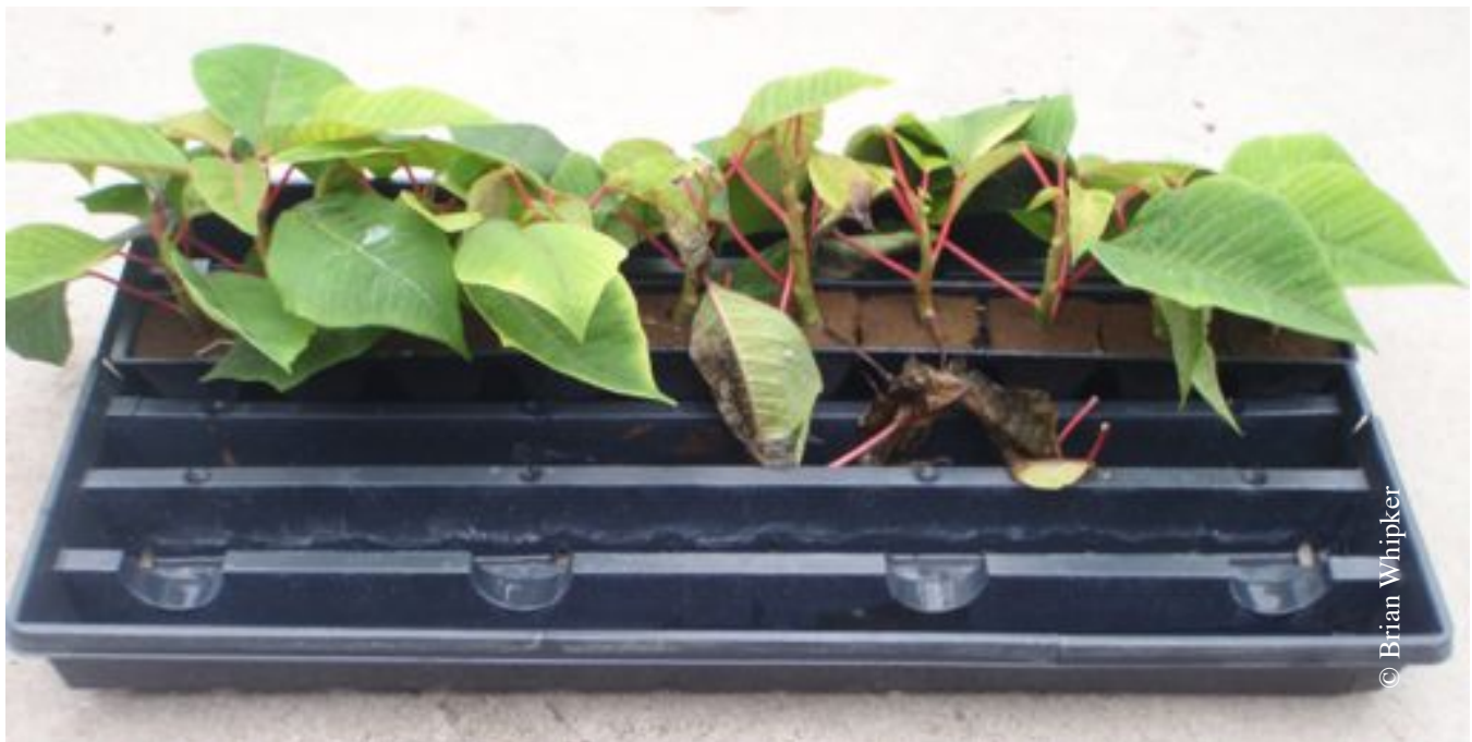
Figure 6. Once Bacterial Soft Rot or Rhizoctonia infect a propagation strip, it is best to discard it. Although signs may not be visible, often times all the cuttings have already been infected by the disease.

The key with both diseases is to start clean to stay clean. Disinfecting the propagation benches, proper substrate handling, washing hands between sticking cultivars, and discarding any cutting that are dropped onto the ground will aid in preventing propagation based disease issues.