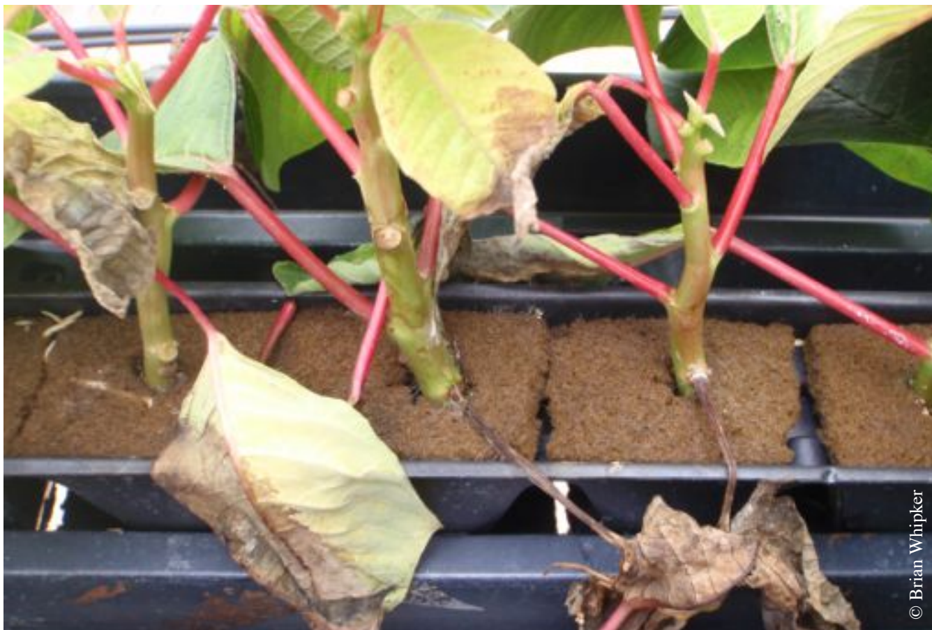
Figure 4. Fungal strands (mycelium) can be seen spreading from cell to cell with Rhizoctonia.